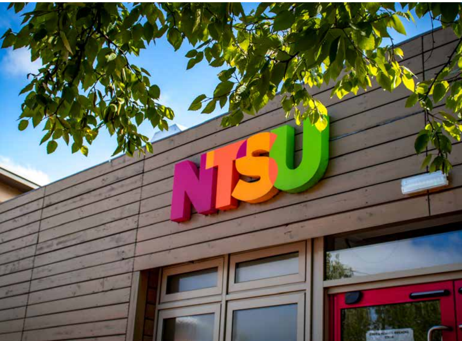
NOTTINGHAM TRENT STUDENTS' UNION